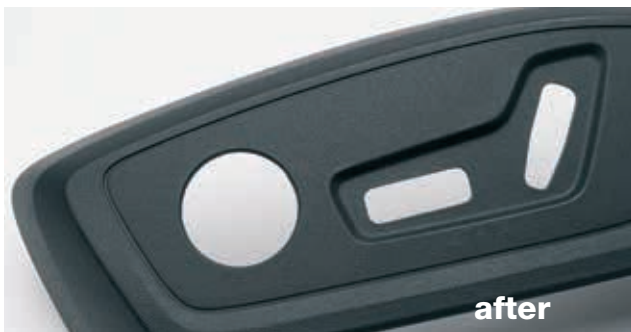
Car seat panel without / with G-Coat – lamination of weld lines